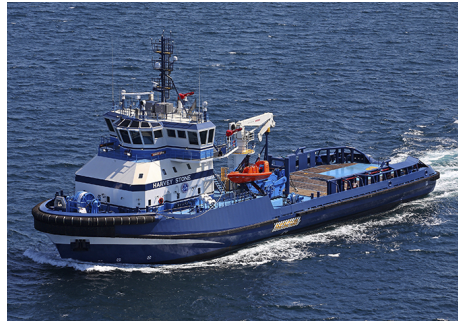
HARVEY GULF M.V. Harvey Stone 2 x GE 12V250MDC (Diesel Electric Power and Propulsion) Multi-Purpose Field Support Vessel (MPFSV)

Harley Marine operates a widely diverse fleet of tugs and barges with diversified marine operations in all major West Coast ports, New York and the American Gulf.