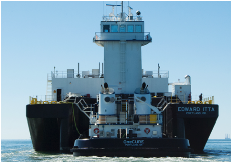
HARLEY MARINE M.V. Harley One Cure 2 x GE 6L250 Marine Engines (Mechanical Propulsion) Articulated Tug Barge (ATB)

Harley Marine operates a widely diverse fleet of tugs and barges with diversified marine operations in all major West Coast ports, New York and the American Gulf.