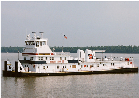
INGRAM BARGE COMPANY M.V. Mark Duley 2 x GE 8L250MDC (Mechanical Propulsion) Inland Marine Tow Boat

Lindblad Excursions has a long term partnership with National Geographic and operates a wide array of Expeditions and Luxury Cruise ships. These vessels take travelers and adventurers into the most remote and pristine parts of the planet including Arctic and Antarctic.