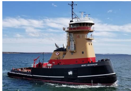
REINAUER TRANSPORTATION M.V. Bert Reinauer 2 x GE 12V250MDC (Mechanical Propulsion) Articulated Tug Barge (ATB)

Ingram Barge Company is one of the largest operators of tow boats and barges on the nation's inland waterway system. They hold the position of the largest dry cargo carriers and one of the top liquid carriers in America.