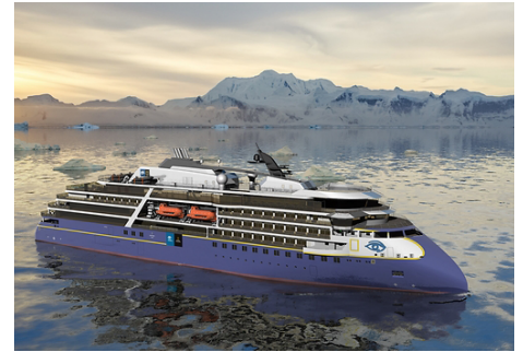
LINDBLAD EXPEDITIONS M.V. National Geographic Endurance 2 x GE 8L250MDC and 2 x 12V250MDC (Diesel Electric Power and Propulsion) Arctic Excursion Cruise Vessel

Harvey Gulf operates a wide variety of offshore supply vessels including the M. V. Harvey Stone. This innovative vessel serves as a dedicated field support vessel for the Shell Stones FPSO offshore terminal.