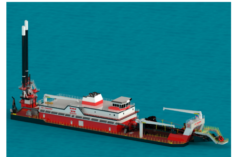
WEEKS MARINE J.S. Chatry 2 x GE 16V250MDC and 3 x 8L250MDC (Mechanical Pump Drive and Diesel Electric Power) Cutter Head Dredging Vessel

Reinauer Transportation operates a variety of coastwise and ocean going tug vessels including: conventional and tractor tug boats, barges and articulated tug barge (ATB) units.